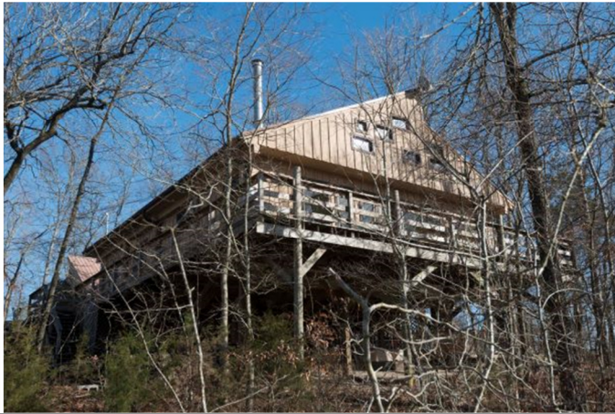
HOT SPRINGS ARKANSAS