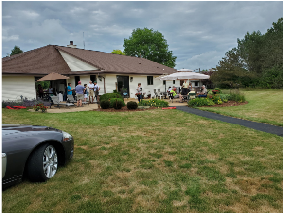
JUST ONE OF THE DINING AREAS