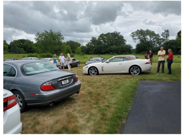
ENJOYING CARS BEFORE THE RAIN SET IN