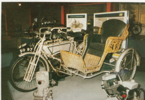
Typical Motorcycle sidecar from just after World War I.