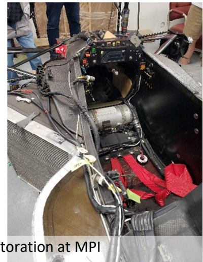
Undergoing restoration at MPI