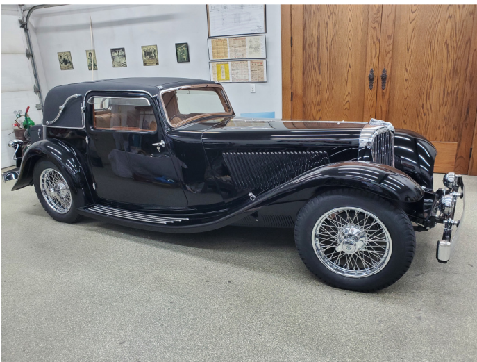
Happy 90 th Birthday to the 1934 SS1 7 years in restoration due to parts collecting, stock car & partial Excalibur restorations

Thanks to all who contributed food to the club sponsored main course and beverages, we loved the appetizers, all the side dishes and of course, great desserts! Thanks in particular to Deb Korneli who always puts so much effort into these events for our members!