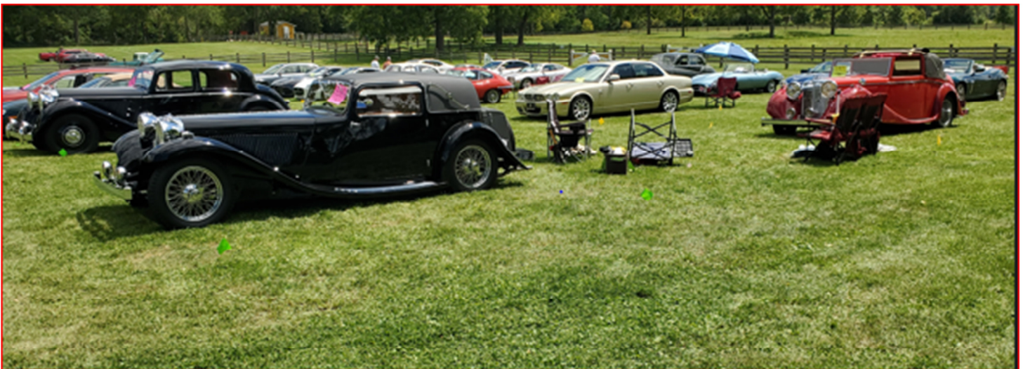
Three Wisconsin Jaguars in a sea of Illinois Jaguars.