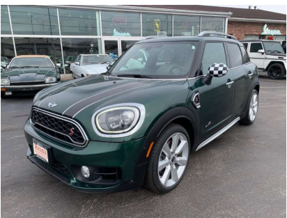
2018 Mini Countryman $19,995