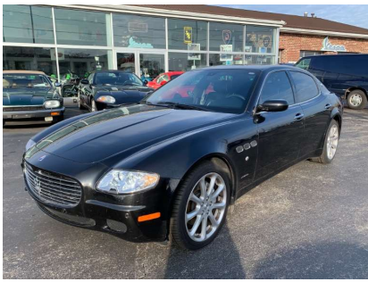
2006 Maserati $17,995

REINA INTERNATIONAL AUTO 12730 WEST CAPITOL DRIVE BROOKFIELD, WI 53005 (262) 781-3336