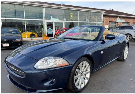
2007 Jaguar XK $22,995

REINA INTERNATIONAL AUTO 12730 WEST CAPITOL DRIVE BROOKFIELD, WI 53005 (262) 781-3336