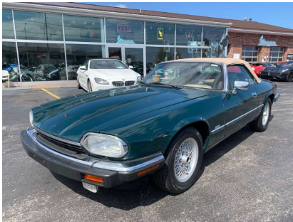
1993 XJS6 Convertible