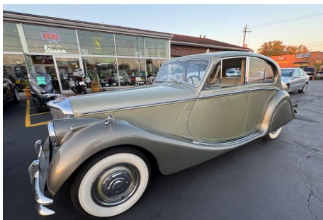
1951 Jaguar MK V $34,995